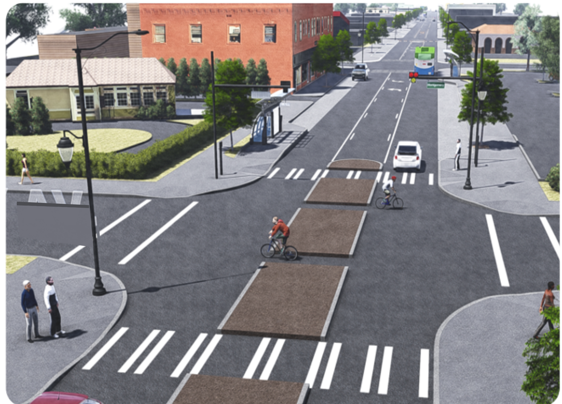
Example Project Elements for 5th Avenue