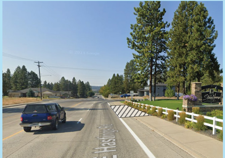
Street view of the station location, looking west