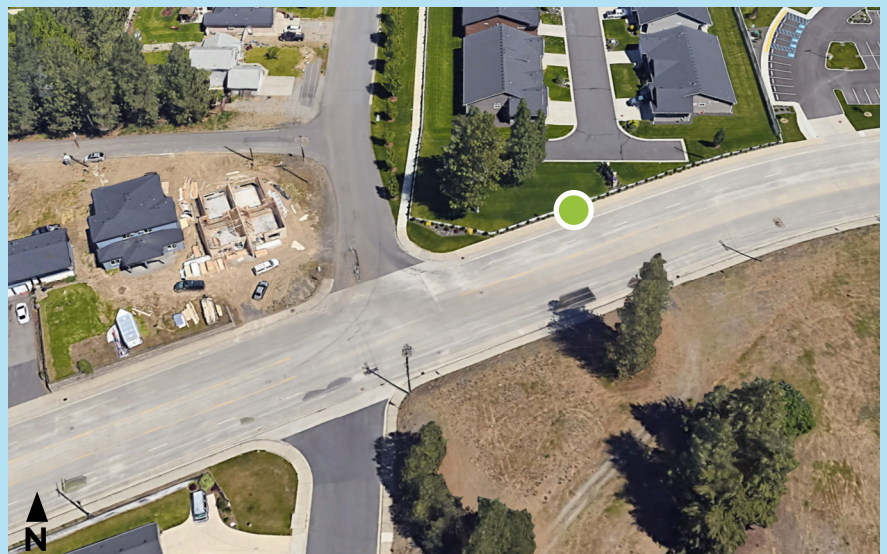
Aerial view of Hastings at Perry - corridor rendering design in progress

For more information, visit www.spokanetransit.com/divisionbrt or email divisionbrt@spokanetransit.com