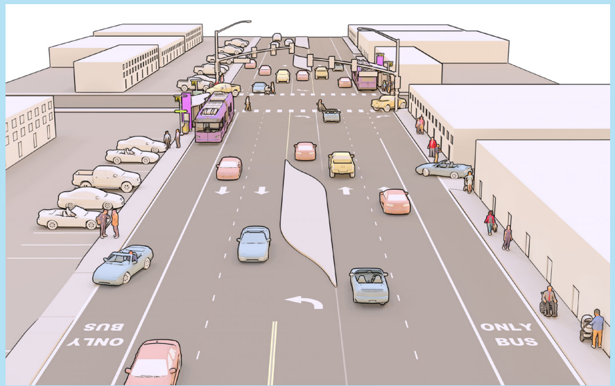
Draft corridor rendering, Division at Price/Magnesium to Division/Ruby couplet - future condition

For more information, visit www.spokanetransit.com/divisionbrt or email divisionbrt@spokanetransit.com