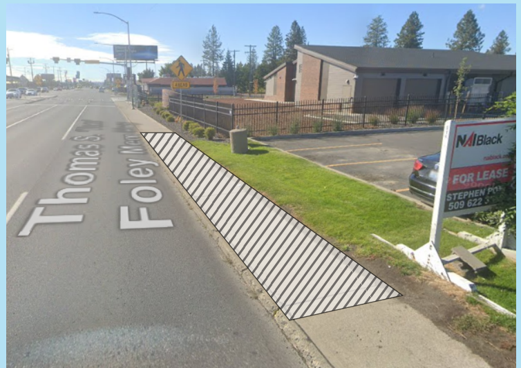
Street view of the station location, looking south