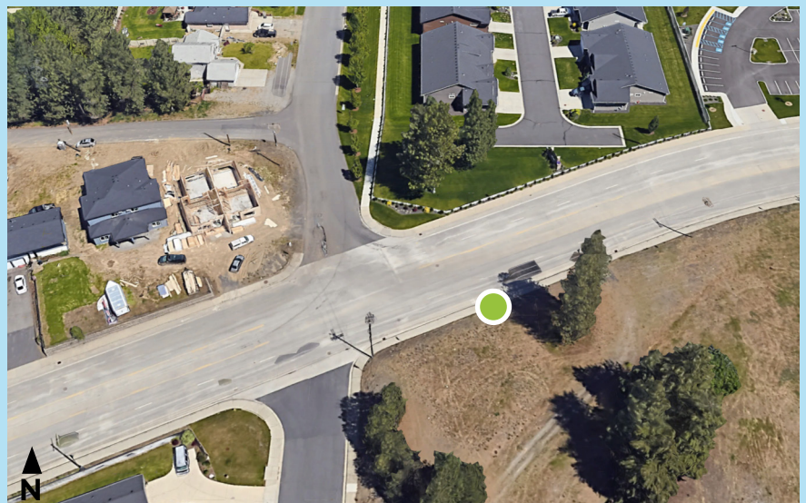
Aerial view of Hastings at Perry - corridor rendering design in progress

For more information, visit www.spokanetransit.com/divisionbrt or email divisionbrt@spokanetransit.com