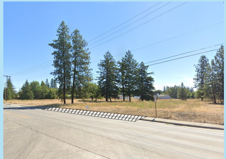
Street view of the station location, looking east (Google Street View)