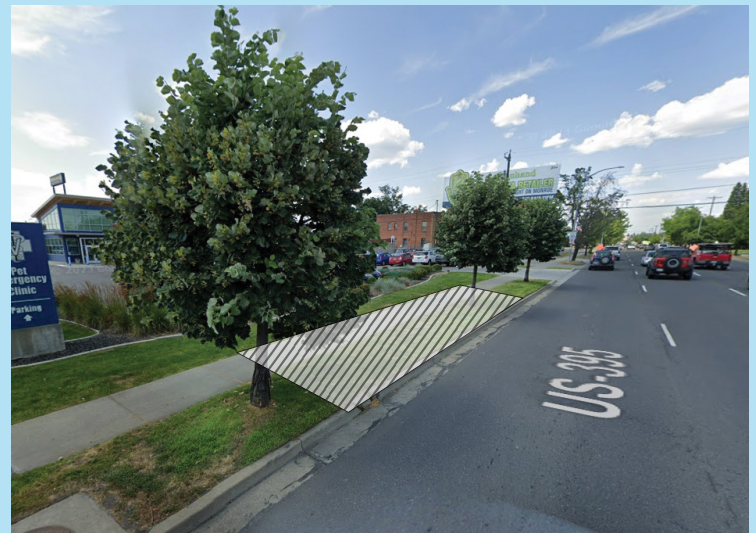
Street view of the station location, looking north