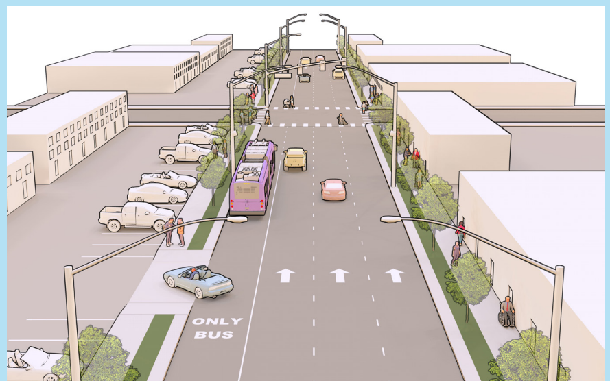
Draft corridor rendering - Ruby couplet between Cataldo Ave and Jackson Ave

For more information, visit www.spokanetransit.com/divisionbrt or email divisionbrt@spokanetransit.com