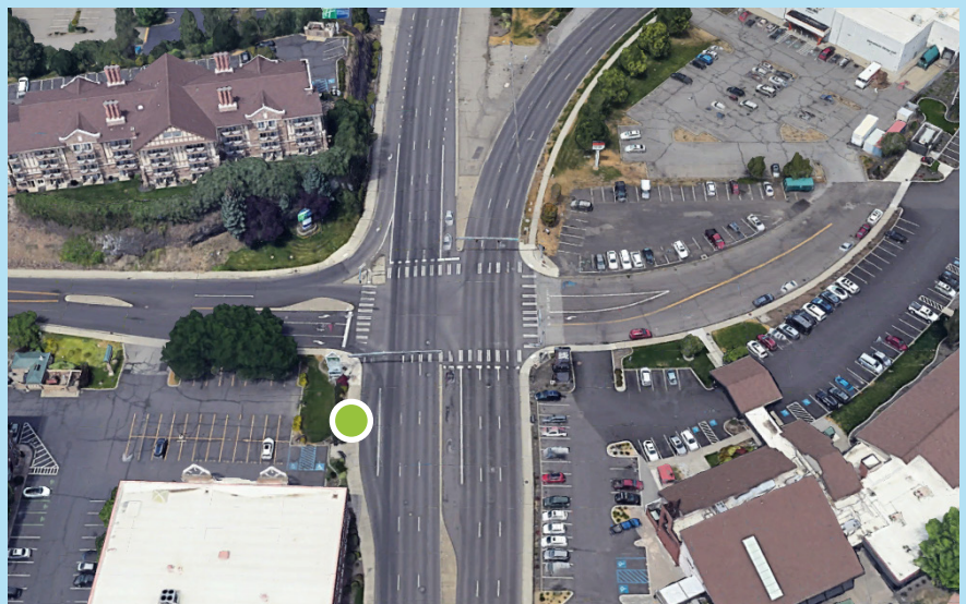
Aerial view of Division at North River - corridor rendering design in progress

For more information, visit www.spokanetransit.com/divisionbrt or email divisionbrt@spokanetransit.com