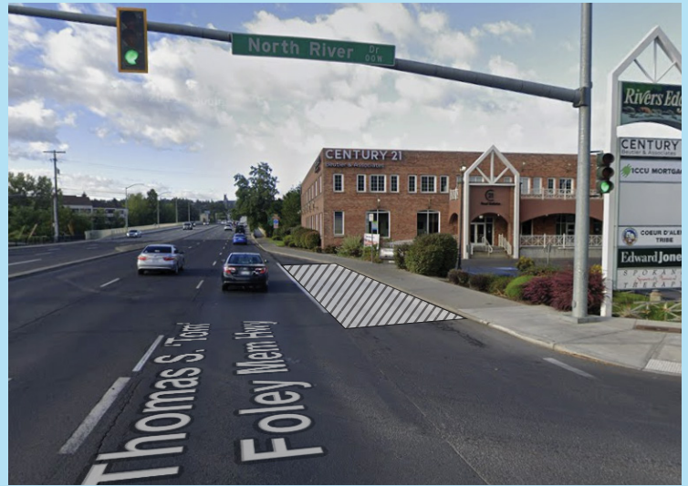
Street view of the station location, looking south (Google Street View)