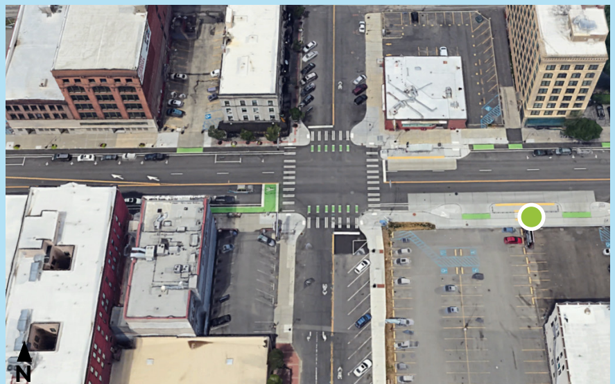
Aerial view of Riverside at Bernard - corridor rendering design in progress

For more information, visit www.spokanetransit.com/divisionbrt or email divisionbrt@spokanetransit.com