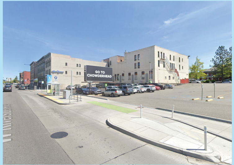
Street view of the station location, looking east