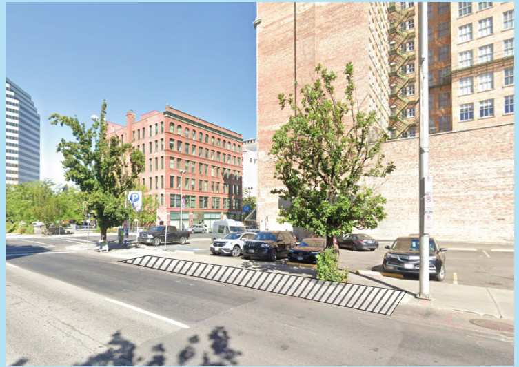
Street view of the station location, looking west (Google Street View)