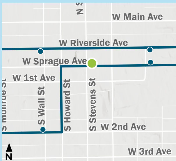
Division BRT alignment, 2nd Ave to Riverside Ave