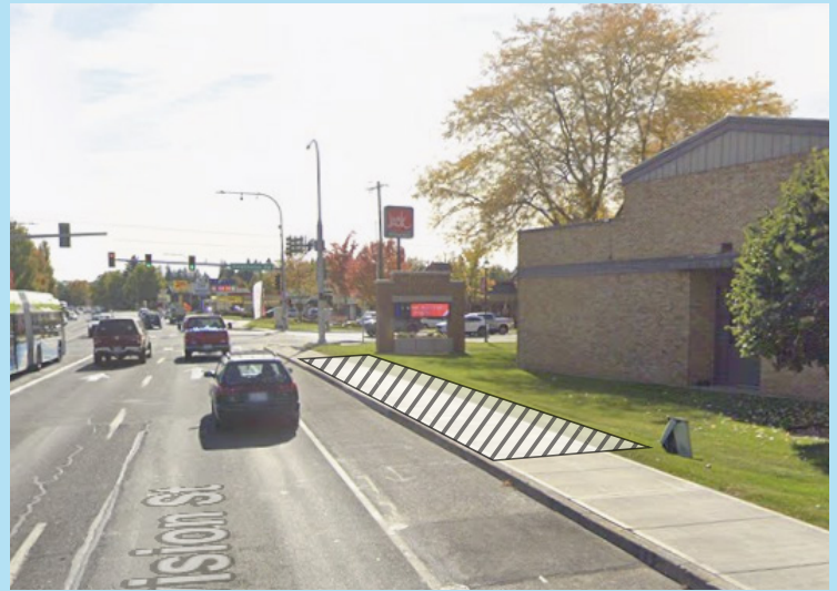
Street view of the station location, looking south