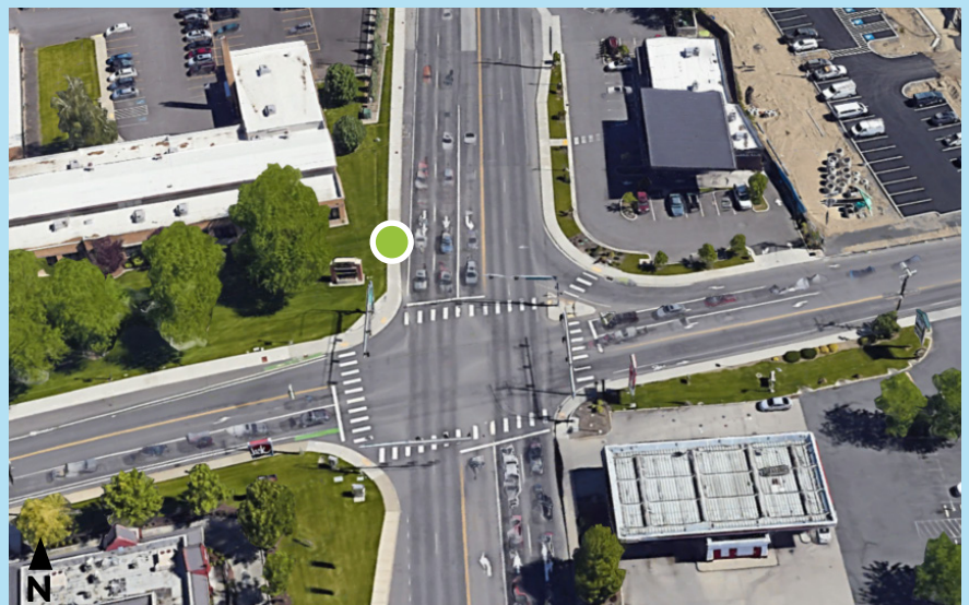
Aerial view of Division at Hawthorne - corridor rendering design in progress

For more information, visit www.spokanetransit.com/divisionbrt or email divisionbrt@spokanetransit.com