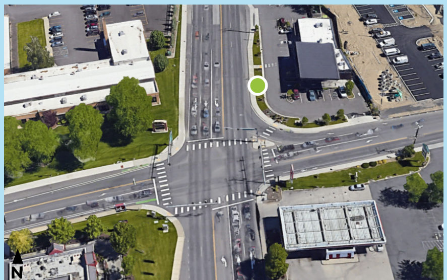
Aerial view of Division at Hawthorne - corridor rendering design in progress

For more information, visit www.spokanetransit.com/divisionbrt or email divisionbrt@spokanetransit.com