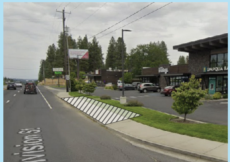
Street view of the station location, looking north (Google Street View)