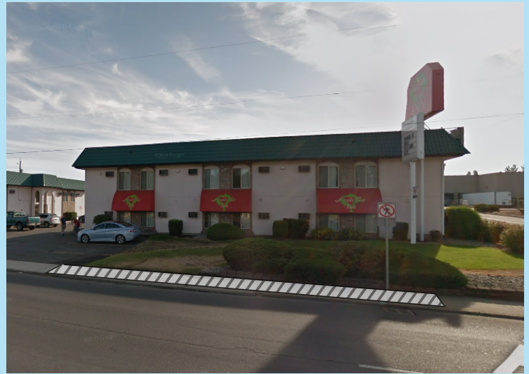
Street view of the station location, looking north