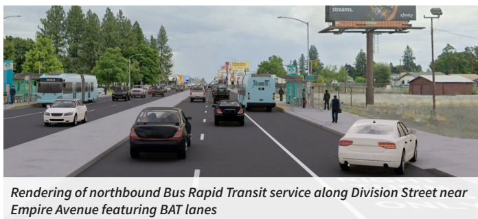
Rendering of northbound Bus Rapid Transit service along Division Street near Empire Avenue featuring BAT lanes